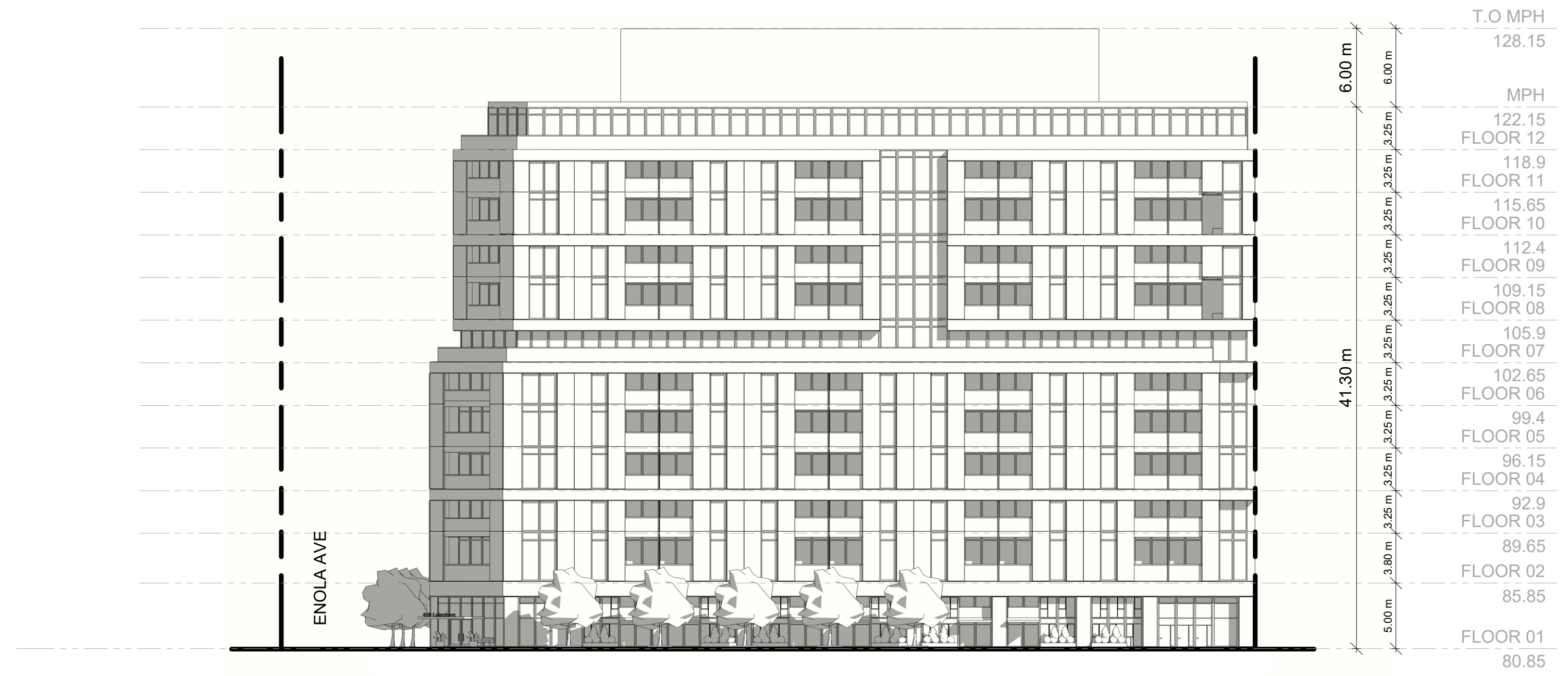
1 NORTH ELEVATION RZ301 1 : 300