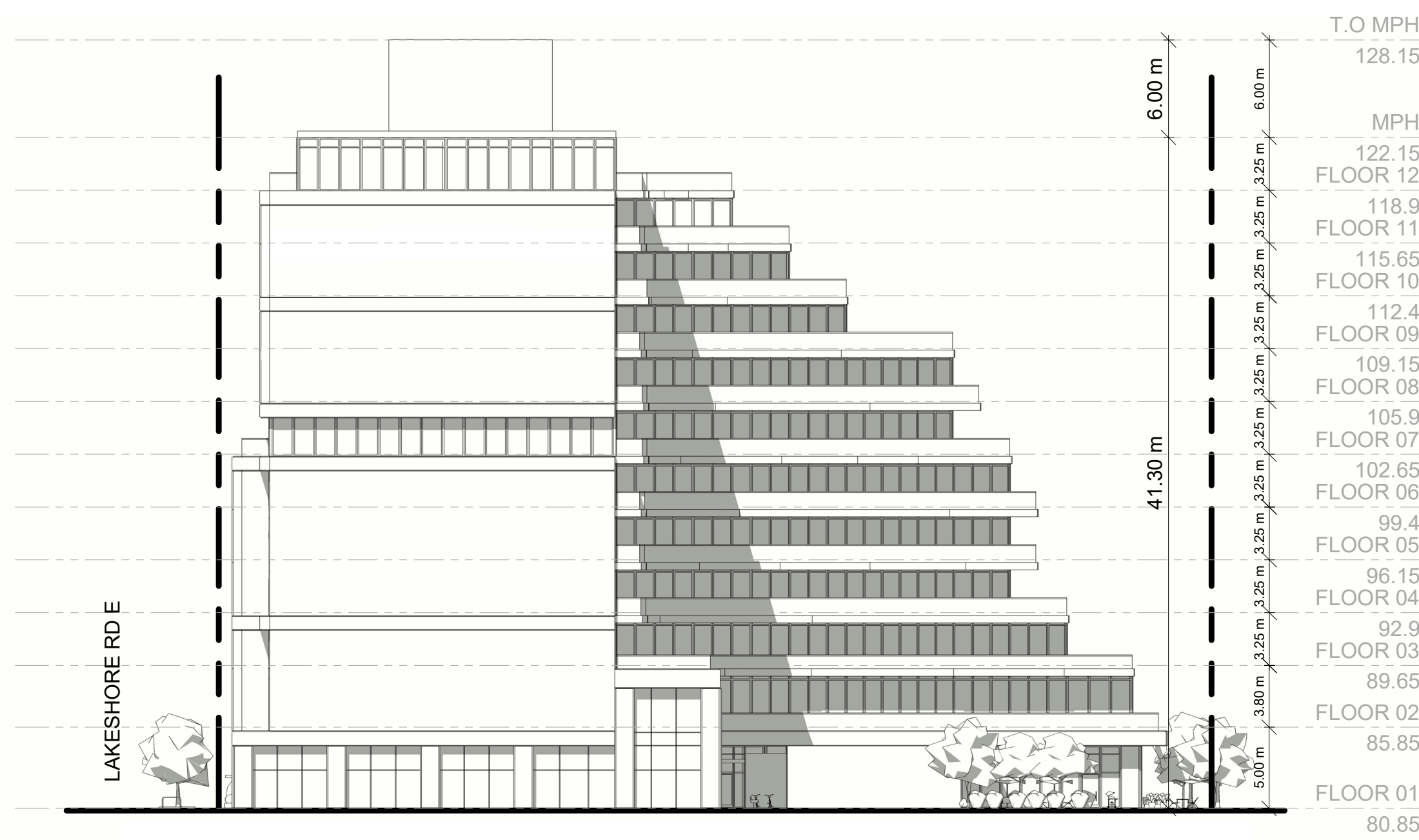
4 WEST ELEVATION RZ301 1 : 300