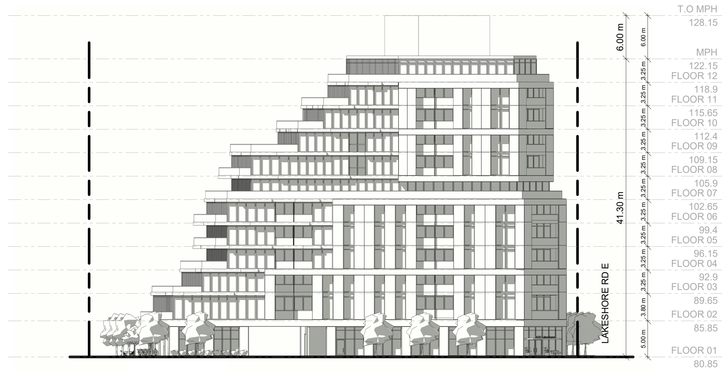
3 EAST ELEVATION RZ301 1 : 300

This drawing, as an instrument of service, is provided by and is the property of Turner Fleischer Architects Inc. The contractor must verify and accept responsibility for all dimensions and conditions on site and must notify Turner Fleischer Architects Inc. of any variations from the supplied information. This drawing is not to be scaled. The architect is not responsible for the accuracy of survey, structural, mechanical, electrical, etc. information shown on this drawing. Refer to the appropriate consultant drawings before proceeding with the work. Construction must conform to all applicable codes and requirements of all relevant taxing jurisdictions. The contractor working from drawings not specifically marked for construction must assume full responsibility and bear costs for any corrections or damages resulting from his work.